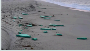
Images depict broken turbine blade and debris recently washed ashore on local beaches.